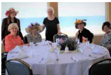
Hull GC members wore festive hats to the club's annual luncheon.

At Scituate Garden Club's annual meeting, members each were given a newly-introduced hosta seedling, H. 'Scituate Sunrise,' a fitting memento of the club's 100th anniversary.