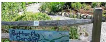
Entrance to the Stony Brook pollinator garden, maintained by the Norfolk GC and other volunteers

Garden Club of Norfolk members are continuing to help revitalize the butterfly garden at the Massachusetts Audubon Society Stony Brook Wildlife Sanctuary. In 2016 the Massachusetts Master Gardener Association (MMGA) awarded the club a grant to help with the cost of adding more pollinator plants. The resulting garden now provides a quiet haven for visitors to relax and observe the flowers and the pollinators.