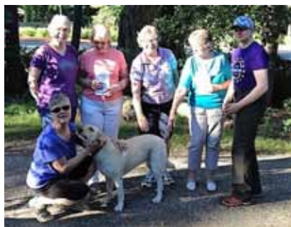
Members of the Friendly GC of Beverly visited Rest. Stop. Ranch., the recipient of donated plants left over from the club's sale.

grams. For more information, visit Rest-Stop-Ranch.com .