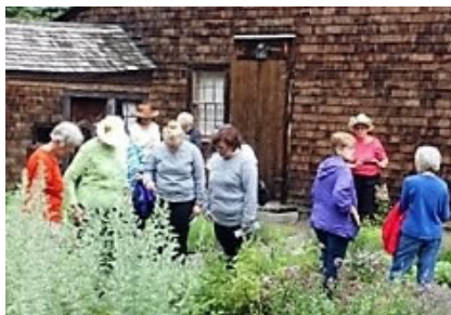
Billerica GC members toured the herb garden at Job Lane House, Bedford

In July Billerica Garden Club stepped back in time, attending a tour of the historic Lillian Dutton Memorial Herb Garden, which is maintained by the Bedford Garden Club. The garden is part of the Job Lane House property, a memorial to the character of the area's early colonists.