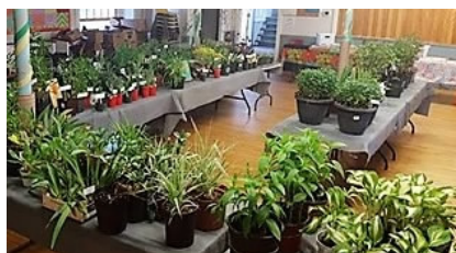
Country Lane GC (Chelmsford) held a successful plant sale.

The Country Lane Garden Club (Chelmsford) held its annual spring plant sale at the First Parish UU Church. The sale featured plants from members' gardens as well as peonies from Sunny Meadow Farm, which is operated by the Chelmsford Open Space Stewardship. The event is popular for its bargains and for the gardening advice available from club members. Proceeds from 2017 sales were among the highest ever achieved, with close to 500 plants sold.