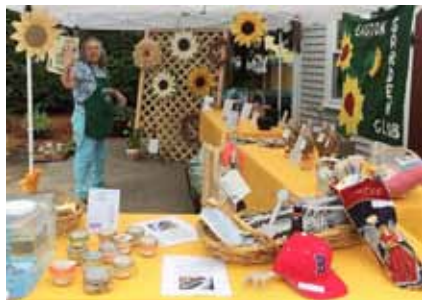
Easton GC's garden tour featured a fun boutique.

Easton Garden Club hosted a summer garden tour, "Back to Our Roots." The event showcased unique gardens belonging to five members and also included a bonus tour of historic Queset Gardens. The club distributed educational information and ran a garden boutique stocked with items created or donated by members.