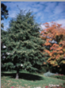
Redmond Linden Tilia americana 'Redmond' 50'h x 25'w