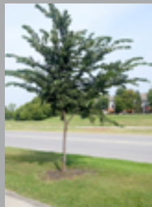
Prairie Expedition Elm Ulmus americana 'Lewis and Clark' 60'h x 40'w