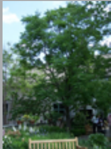
Kentucky Coffeetree Gymnocladus dioica 50-60'h x 30'w