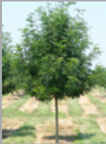
Skyline Honeylocust Gleditsia triacanthos 'Skycole' 45'h x 35'w