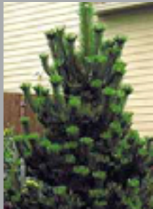
Austrian Pine Pinus nigra 50'h x 35'w