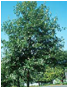
Swamp White Oak Quercus bicolor 60'h x 60'w