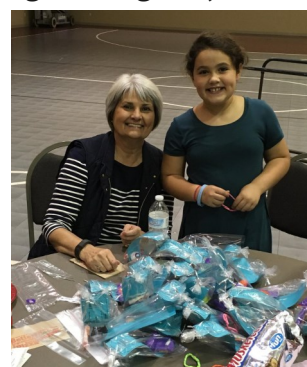
October Operation Serve