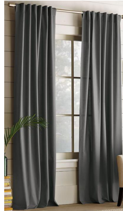
Panel with rod pocket / hidden tabs.

We use a #12 grommet that has an outside diameter of 2" and an inside diameter of 1 9/16.