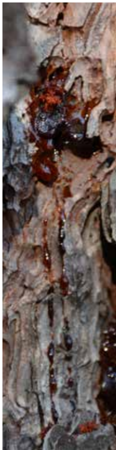
Bark beetle sign.

Most bark beetles have emerged by the time trees have red-brown needles. You may observe other beetles and larvae, but they are of little concern in causing mortality of additional trees. Most are beneficial wood decomposers, not tree killers.