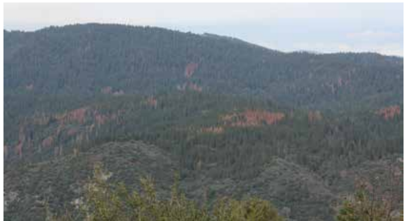
Eastern Madera County, March 2015