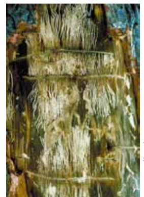
Fir Engraver Beetle