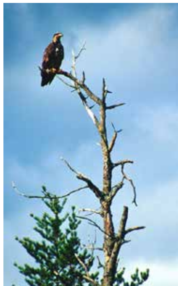
Immature bald eagle on a snag.

Owls, hawks, and eagles use snags to perch and to support their nests. Cavity nesters such as woodpeckers, mountain bluebirds, and chickadees nest in the snag cavities. Chipmunks, squirrels, and other mammals use snags as homes. Bats use areas under loose bark for roosting. Fungi, mosses, and lichens commonly grow in the decaying wood of a snag. Insects chew through the decaying wood, creating tunnels and chambers. Moths and ladybird beetles, and many species of reptiles and amphibians, hide under the bark.