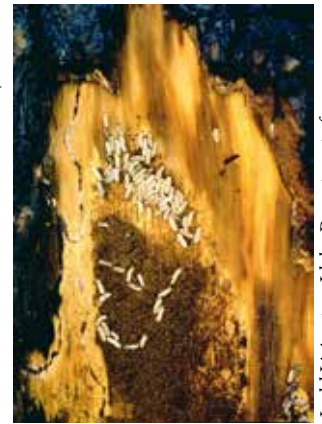
Red Turpentine Beetle

Evidence of attack before crown fade is often hard to detect. Boring dust may be present on the bole, but attacks may occur higher up and are not easily observed from the ground. Pitch tubes are not produced on fir trees. Pitch streaming on the bole of the tree is not always indicative of fir engraver attacks. Crown fade may occur before attacks or beetle exit holes are visible. Attacks during