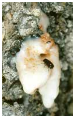
Donald Owen, CAL FIRE, Bugwood.org

Susceptible trees are not always attacked by bark beetles, especially if beetle numbers are low. When beetle populations are high, however, even apparently healthy trees may be attacked. If an individual tree is of high importance for aesthetic or other values, you may want to consider a treatment that may improve its health and vigor and protect it from bark beetle attack.