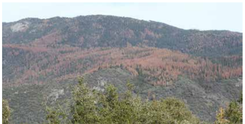
Eastern Madera County, February 2016