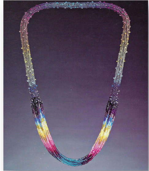
Crocheting with Wire