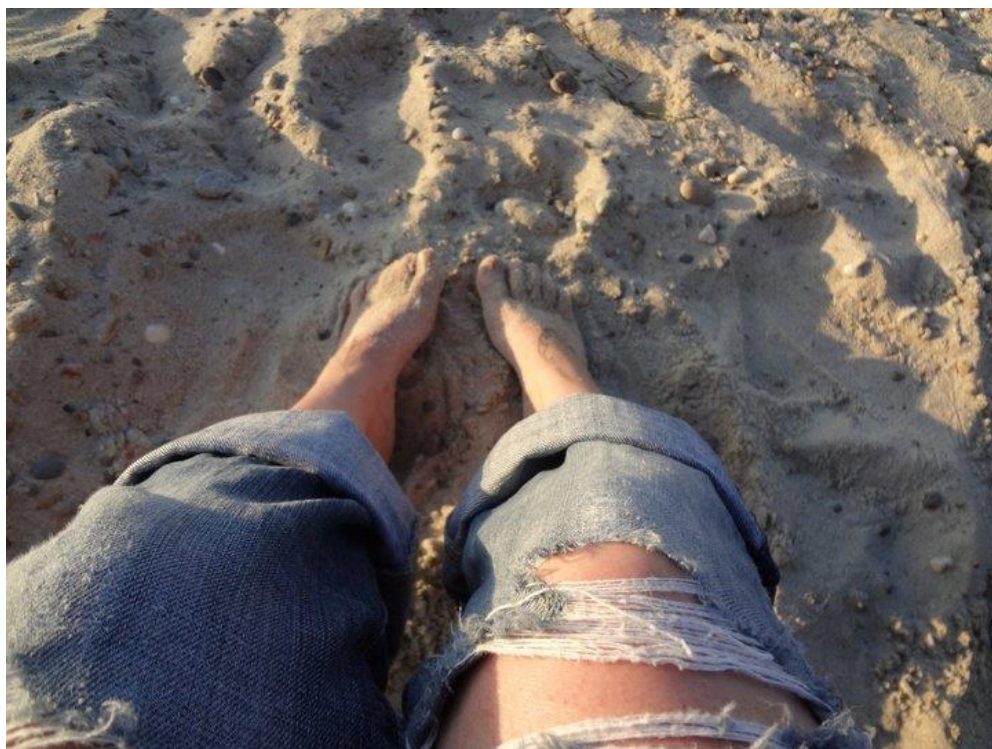
Toes in the Sand