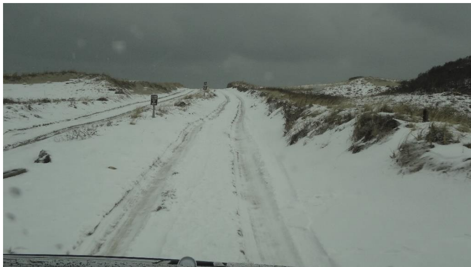
Sandy Neck access trail in winter