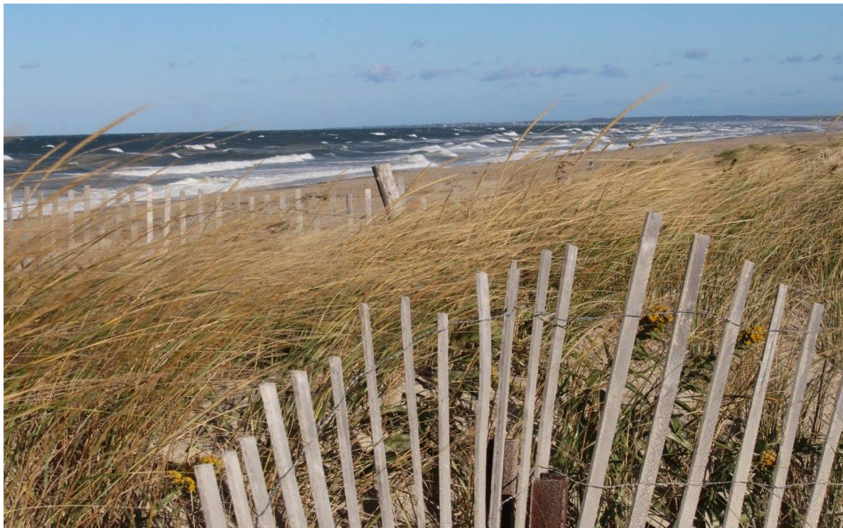
Sandy Neck Beach