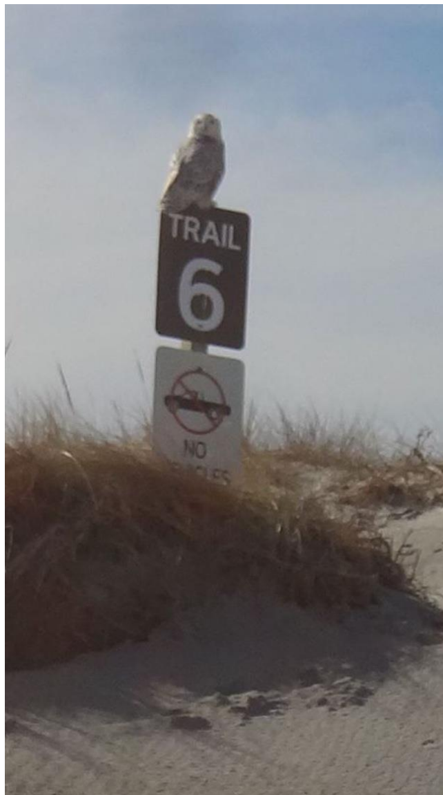
Snowy Owl on Sandy Neck

From South: Take Route 25 to 495 North. Take exit 4 (Route 105) Lakeville. At the bottom of the ramp, take a right onto Route 105 (S. Main St). Follow to the light at Route 28 (W Grove St) then take a left at light. Turn onto Elm St. on the right. The Mitchell Memorial Club is immediately on the left. Please park in the lower lot. Our meeting is up the stairs from the back door.