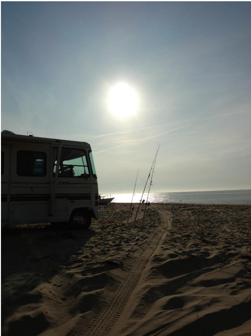
Fall Setting Sunshine

Standish Sportsman's Show, E. Bridgewater, MA