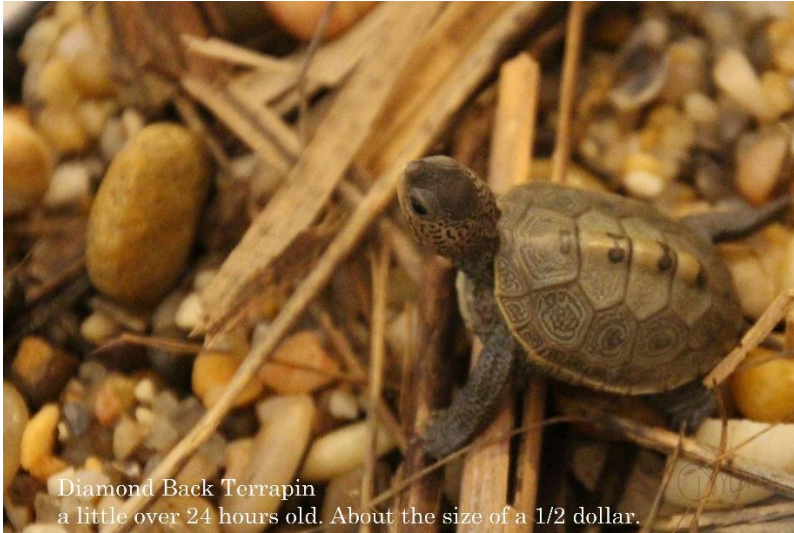
Diamond Back Terrapin a little over 24 hours old. About the size of a 1/2 dollar.