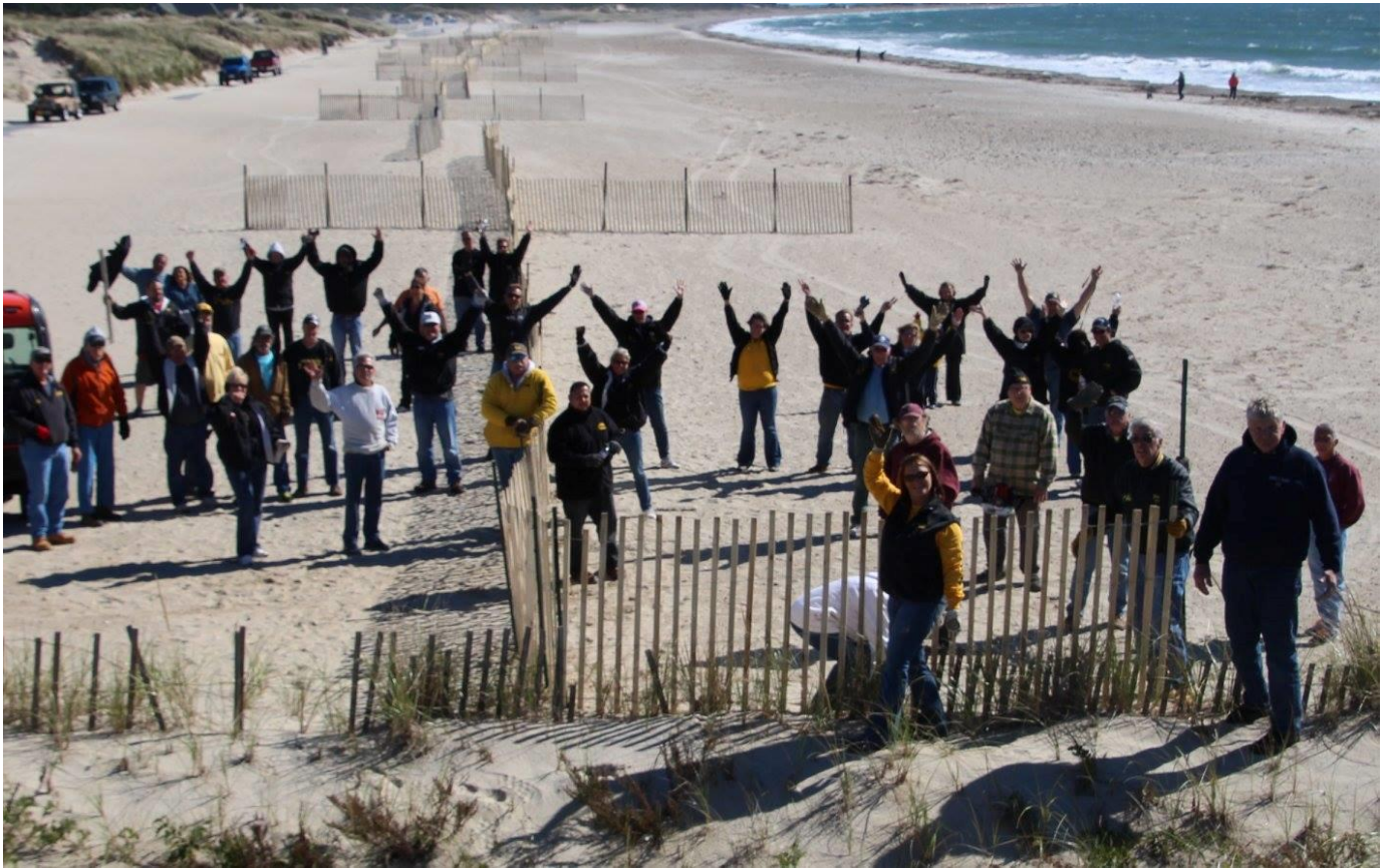
Horseneck project finish 2015

*Please plan to arrive early projects begin at 9:30 AM sharp.