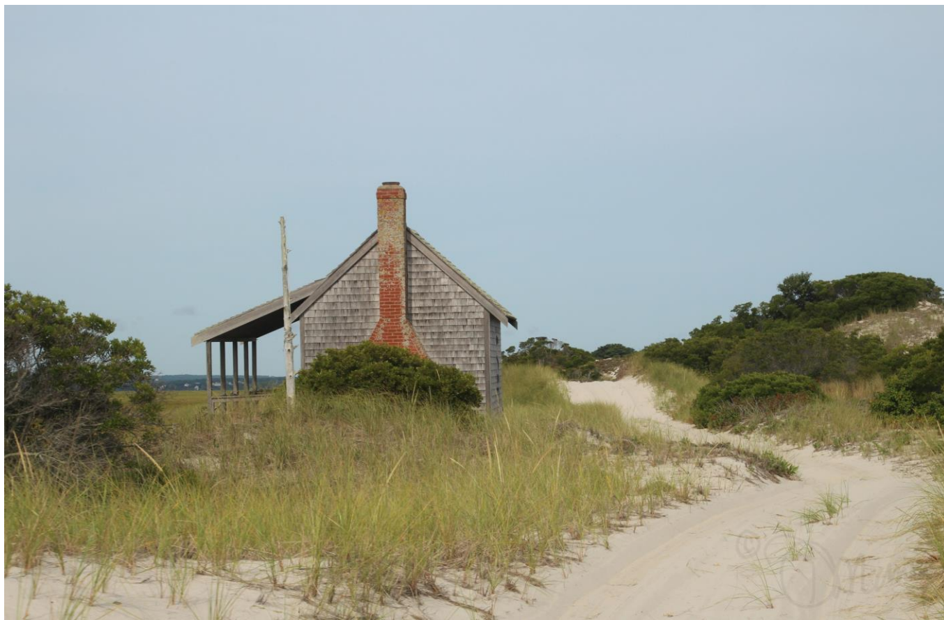
Sandy Neck Back Trail

From South: Take Route 25 to 495 North. Take exit 4 (Route 105) Lakeville. At the bottom of the ramp, take a right onto Route 105 (S. Main St). Follow to the light at Route 28 (W Grove St) then take a left at light. Turn onto Elm St. on the right. The Mitchell Memorial Club is immediately on the left. Please park in the lower lot. Our meeting is up the stairs from the back door.