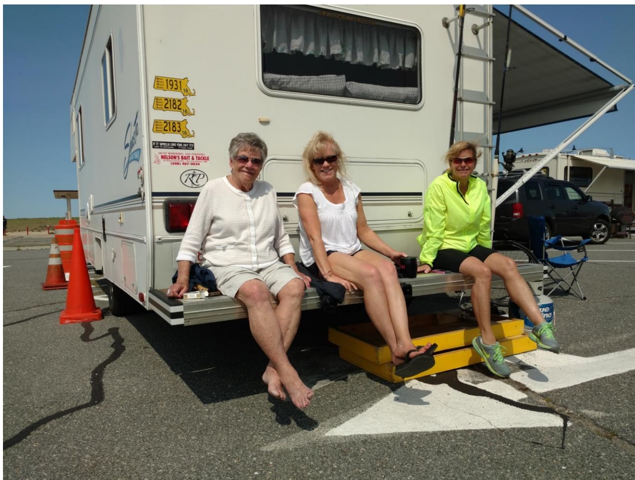
Three of a kind

From South: Take Route 25 to 495 North. Take exit 4 (Route 105) Lakeville. At the bottom of the ramp, take a right onto Route 105 (S. Main St). Follow to the light at Route 28 (W Grove St) then take a left at light. Turn onto Elm St. on the right. The Mitchell Memorial Club is immediately on the left. Please park in the lower lot. Our meeting is up the stairs from the back door.