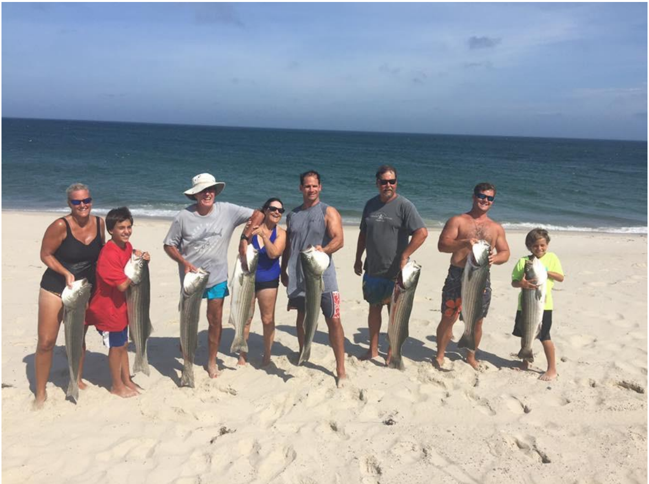
Nauset fish for all 2016