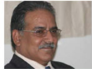
Rt. Honourable Pushpa Kamal Dahal 'Prachanda' Prime Minister of the Federal Democratic Republic of Nepal