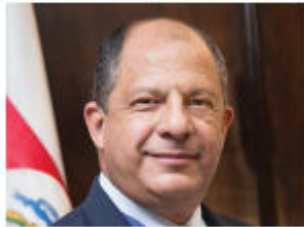
H.E. Luis Guillermo Solís Rivera President of the Republic of Costa Rica