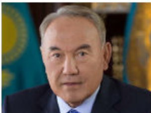
H.E. Nursultan Nazarbayev President of the Republic of Kazakhstan