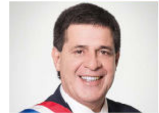
H.E. Horacio Cartes President of the Republic of Paraguay