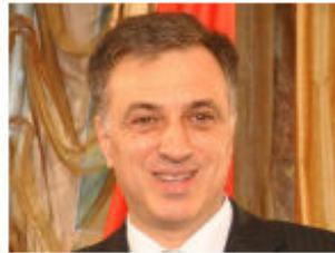
H.E. Filip Vujanović President of Montenegro