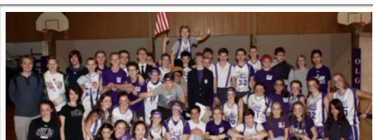
The 8th grade class after the 8th Grade vs. Teacher basketball game