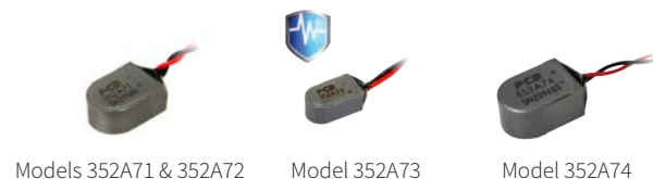
Products Shown at Actual Size

These miniature teardrop ICP® accelerometers feature three different sensitivity options and a flexible twisted pair integral cable for easy routing. Flexible potting material adds strain relief where the cable exits the sensor. All the accelerometers are hermetically sealed in a titanium package. Model 352A72 includes an electrical low pass filter to suppress high frequency noise and decrease the chance of amplifier saturation.