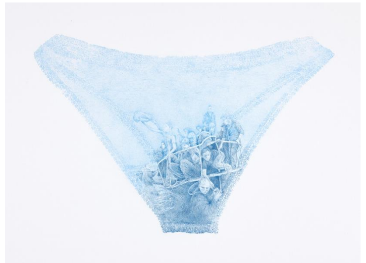
Left: Isabelle van Zeijl, HER , 2017, Perspex face mounted C-print on dibond in tray frame, 110 x 100 cm, Edition of 7. Top: Fabiano Parisi, Il mondo che non vedo 208, 2017, C-Type photograph mounted on dibond in tray frame, 110 x 110 cm, Edition of 8. Bottom: Azita Moradkhani, Not Too Far Away #2 (Victorious Secrets) , 2017, Coloured pencils on paper, 30.8 x 43.5 cm.

Instagram @youngmastersartprize Facebook @YoungMastersArtPrize Twitter @corbettPROJECTS www.young-masters.co.uk