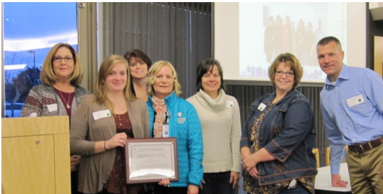
Mid-States Aluminum Corp

This years Five Counties for Tobacco Free Living award recipients: