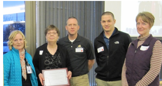
Fond du Lac Housing Authority

Exemplary leadership in Tobacco and Control