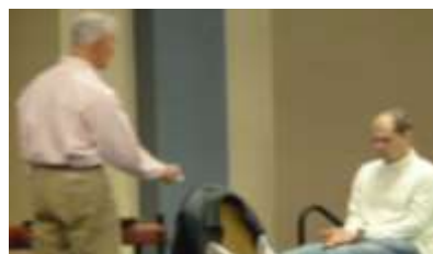
Laser Energetic Detox Workshop