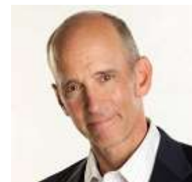
Dr. Joseph Mercola Exercise for the Brain