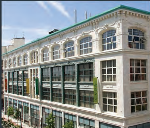
Star Store Campus - University of Massachusetts - College of Visual & Performing Arts

700 Pleasant Street, PO Box 4023, New Bedford, MA 02741 508 990 3442