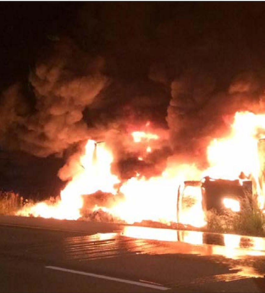
Carmel emergency personnel responded to a fully involved semi fire on U.S. 31 near 131st Street just before 4 a.m. Friday morning. According to the Carmel Fire Department, there were no injuries involved in the fire and the semi was the only vehicle involved in the incident.