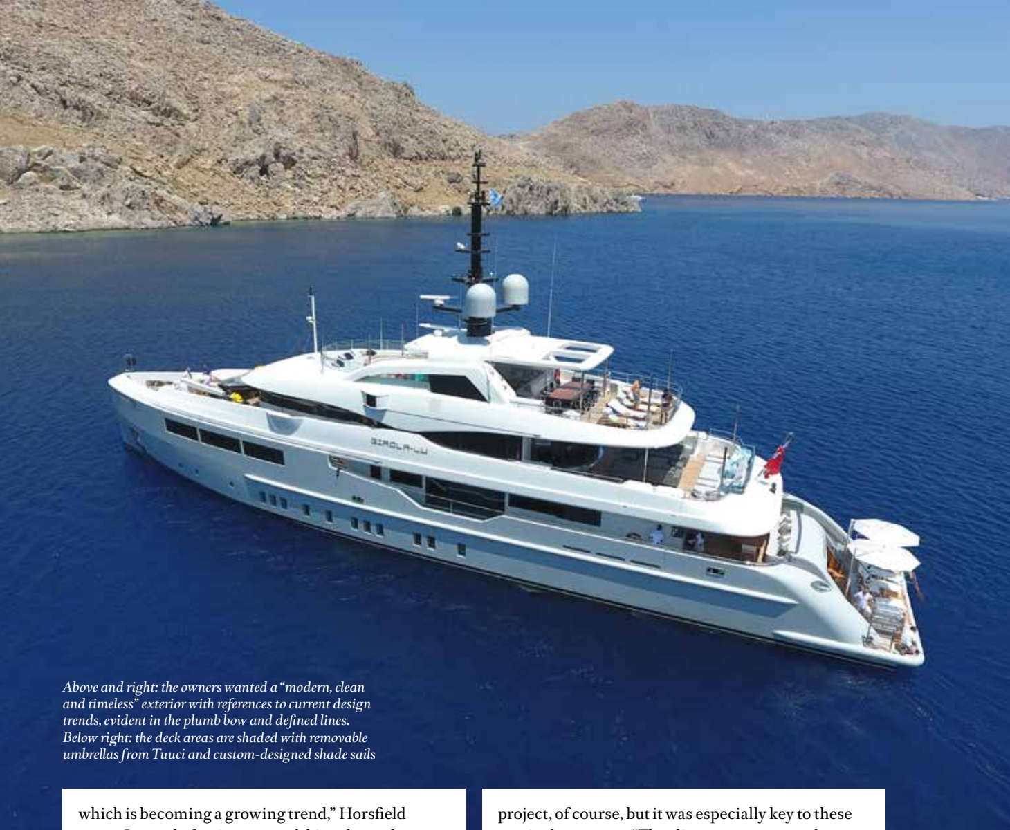
Above and right: the owners wanted a “modern, clean and timeless” exterior with references to current design trends, evident in the plumb bow and defined lines. Below right: the deck areas are shaded with removable umbrellas from Tuuci and custom-designed shade sails