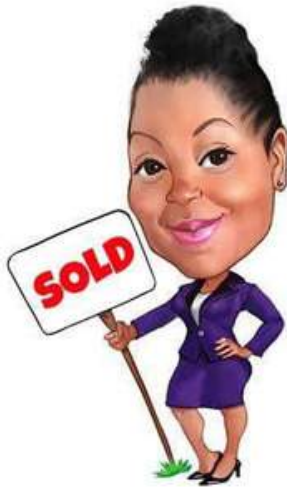
T Givens Realty facebook.com/TGivensRealty

I help buyers and sellers real estate dreams come true. (I am able to help buyers and sellers in other cities by connecting them with other realtors in their desired area)