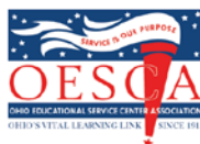
Ohio Educational Service Center Association