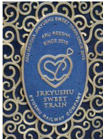
IRT photos by Owen Hardy