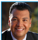
HON. ALEX PADILLA