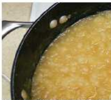
Apple Pear Ginger Sauce prepared from culled HWFC produce

Welcome First United Presbyterian Church! We'll have a brief service and share ideas and a Soul Café brunch.