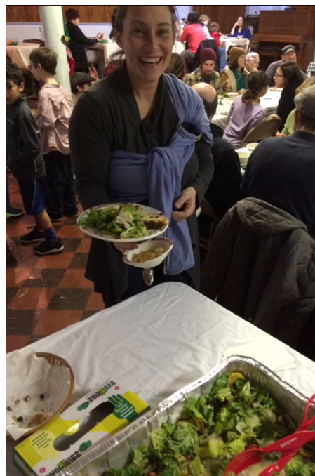
Meal being served