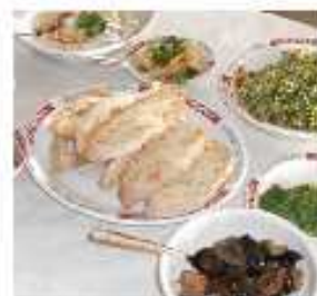
Middle Eastern dinner Café. Bread donated by Placid Baker

Made-to-order Omelets (choose from veggies & cheese) Frittata Pancakes & Maple Syrup Fresh fruit Surprises (as always) Coffee, Mint Tea and Juice