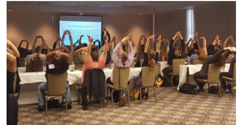
Participants practice yoga poses in a training session at the 40th Annual Governor's Conference in 2016.