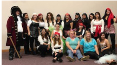
KCSL Head Start staff dress up for their Neverland-themed meetings.

Trainings included self care, conscious discipline, customer service, child abuse and neglect identification and reporting and KCSL values. The theme was "Neverland," and staff dressed up on the last day.