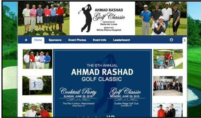
Examples of event and league websites