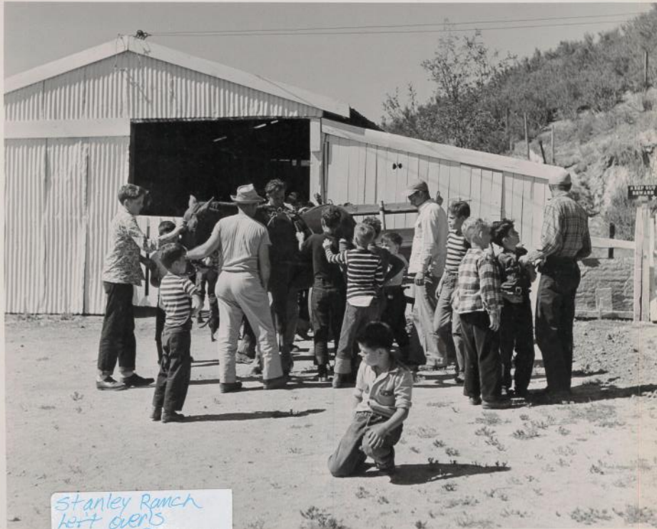
Stanley Ranch left over's 1960