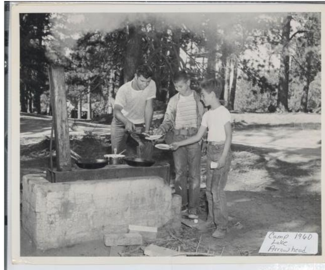
Camp 1960 Lake Arrowhead