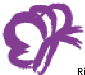
Left: Crazy Construction Right: Revolution Taekwondo

*This is a teacher-led club. Each of these clubs may only be enrolled once per school year.