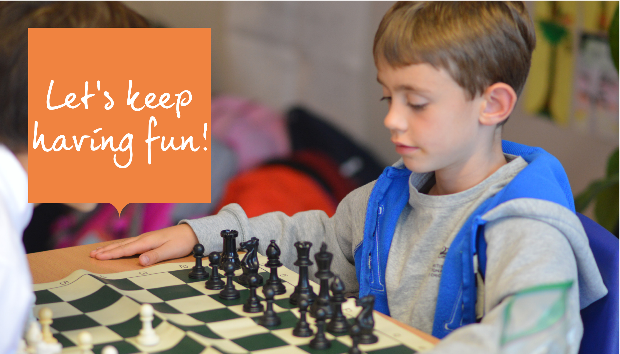
Pictured above: Chess Club