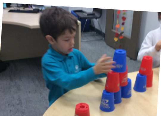
Pictured: Speed Stacking Club