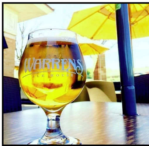
Show Background 29% More Likes Warren's Ale House