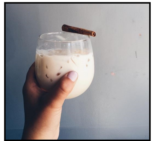
One Dominant Color 17% More Likes River City Roasters