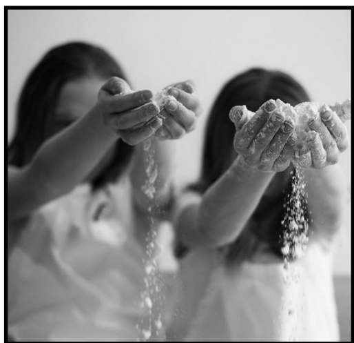
Low Saturation 18% More Likes Gia Mia Pizza Bar