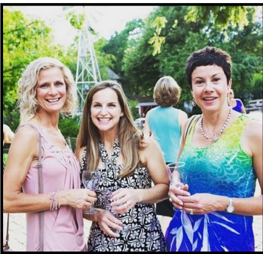
High Lightness 24% More Likes Wheaton Park District

Posts with @mentions get 56% more engagement