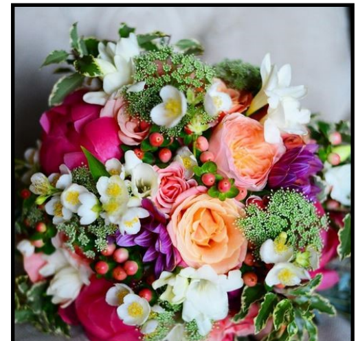
Textured 79% More Likes Andrew's Garden