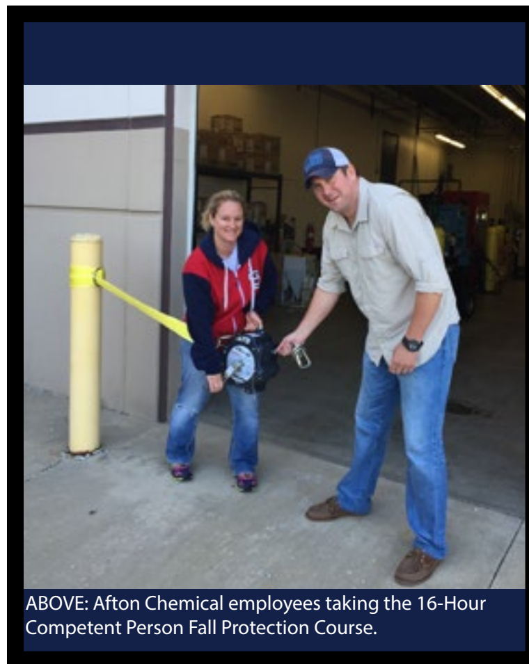
ABOVE: Afton Chemical employees taking the 16-Hour Competent Person Fall Protection Course.