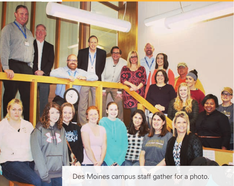
Des Moines campus staff gather for a photo.