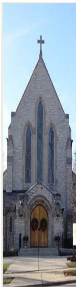
Outside of Christ Church Episcopal - Whitefish Bay