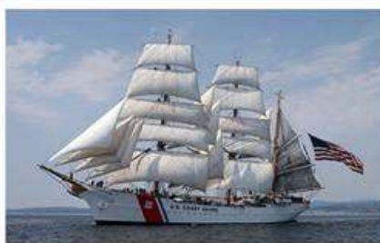
SAILING SKILLS & SEAMANSHIP USCG Auxiliary - Norwalk Flotilla Spring 2017

Sailing Skills & Seamanship (SS&S) is a comprehensive course in basic sailing and boating safety that goes well beyond the eight-hour class required for the Connecticut combined Safe Boating/PWC certificate and covers many additional fundamentals important to good seamanship.