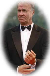
My New Uniform