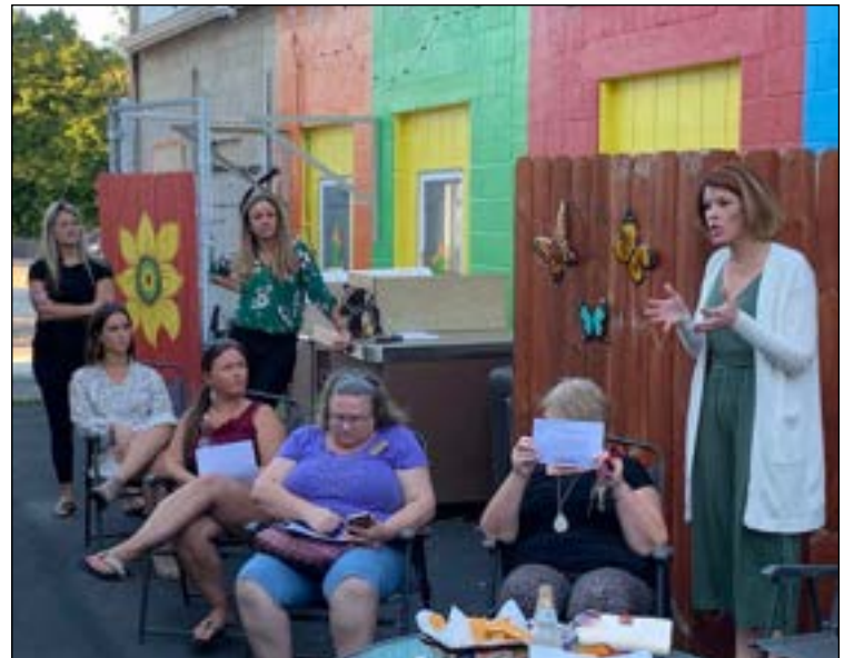
AMBASSADORS MEETING AT LAS MILPAS SEPTEMBER 27