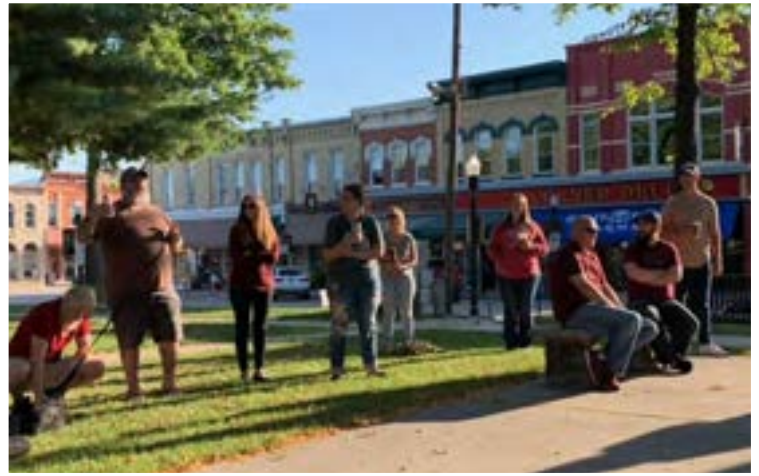
DOWNTOWN BARABOO INC. MEETING SEPTEMBER 17