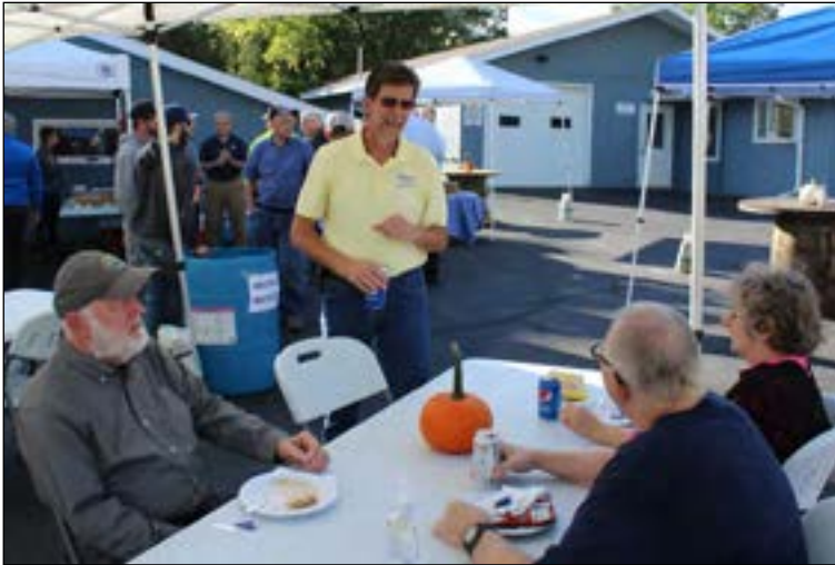
HILL'S WIRING 105th ANNIVERSARY CELEBRATION SEPTEMBER 22