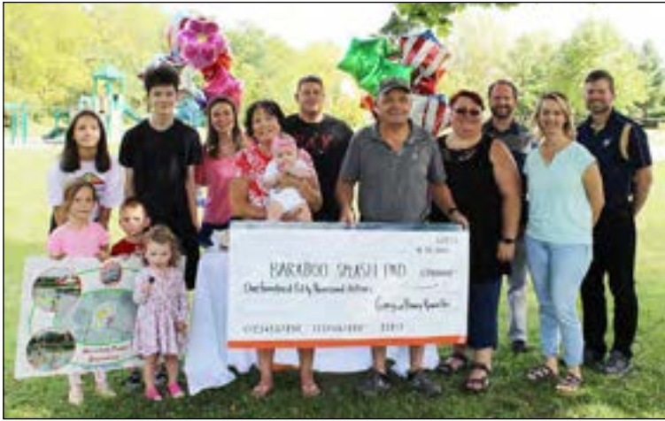
ATTRIDGE PARK SPLASH PAD DONATION SEPTEMBER 15