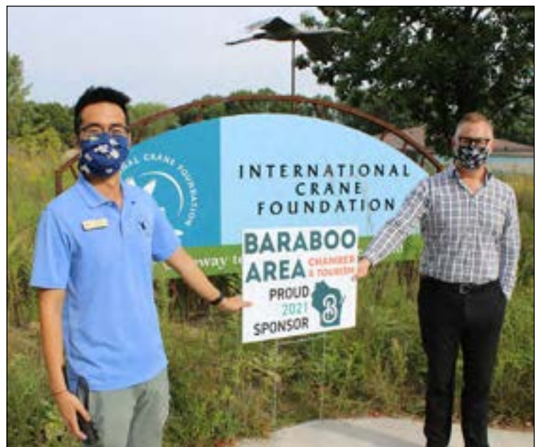
International Crane Foundation