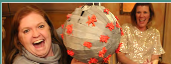
AMBASSADORS CLUB HOLIDAY PARTY / PAGE 3