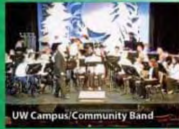
UW Campus/Community Band