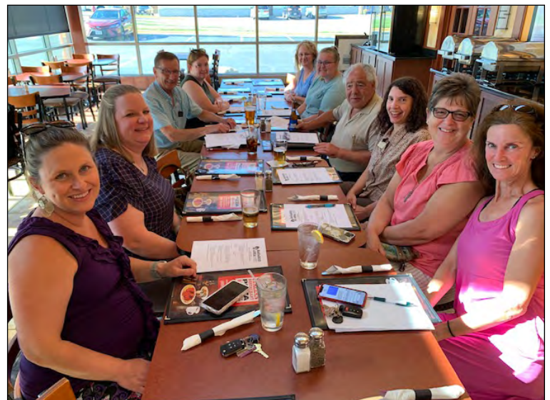
June 20 Ambassadors Club meeting at Mike's Italian Restaurant