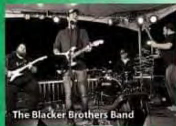
The Blacker Brothers Band