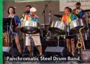
Panchromatic Steel Drum Band