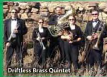
Driftless Brass Quintet