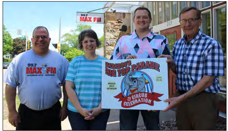
99.7 MAX FM