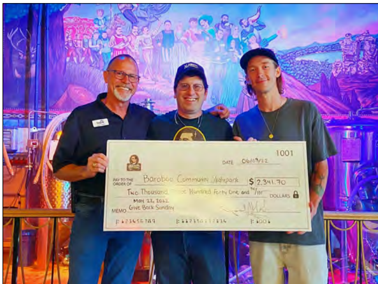
April 22 skatepark fundraiser