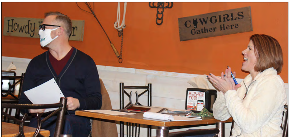
AMBASSADORS CLUB MEETING AT PIZZA RANCH • JANUARY 18