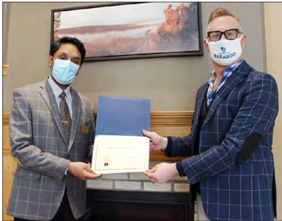
PROCLAMATION FROM U.S. SEN. RON JOHNSON CELEBRATING CHAMBER's 70th ANNIVERSARY