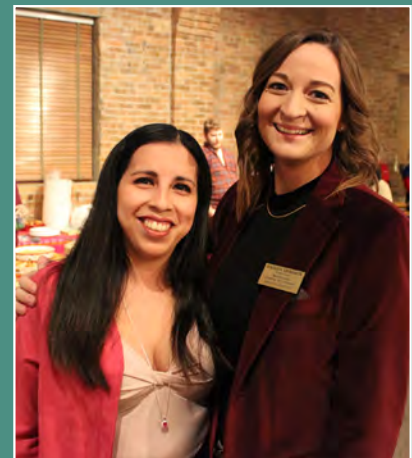
ANNUAL DINNER PHOTOS Pages 2-3