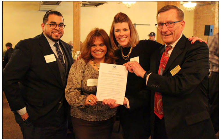
One of the evening's many highlights was the announcement of a new partnership with the Wisconsin Latino Chamber of Commerce.