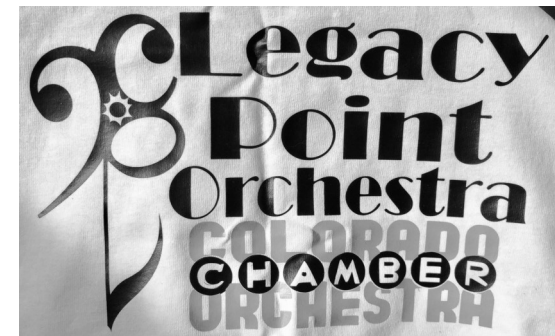
Image of LPE Custom Made Shirts

March 8th at LPE at 6:30 pm, combined with LPE band and Franktown Elementary band and orchestra.