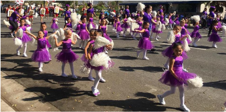
The Royal Friends marched in the Azusa and El Monte Parade the last two Saturdays. Looks like it's time to take a Saturday off.