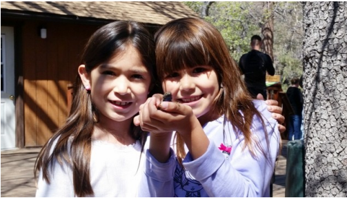
Lizard Hunt Victors

Come join us for a day of fun at Mount Kare, Kare Youth League's scenic mountain camping facility in the Angeles National Forest. You can sit and relax or choose to participate in activities throughout the day.