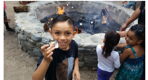
Campfire & Marshmallow Roast

The game room will be open during the day for ping-pong, pool, foosball and other games you can play with your family. There will also be volleyball, hockey and basketball games outside including the popular "Bear Pit Ball".