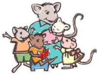
Nursery Attendant Needed

The Bishop will be meeting with lay and clergy on our district. Clergy will meet from 2-4pm and laity from 6-8 pm. This is a time to be in conversation with our Episcopal leader.