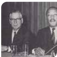
Legacy of Temple Emanu-El