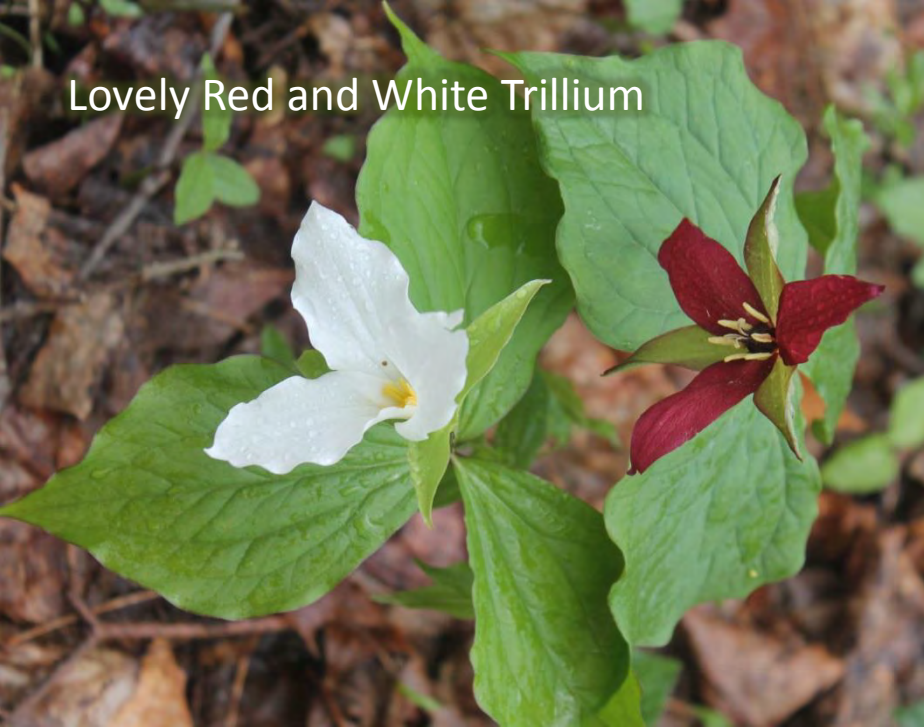
Lovely Red and White Trillium