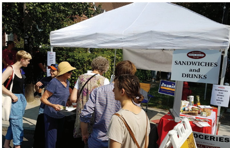
Westcott St Cultural 2017 Crowd at Co-op Booth