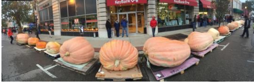
Pumpkin weigh-in 2015