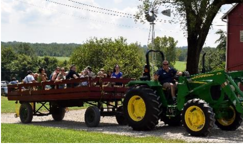
Help needed for fall hayrides at Forest Run