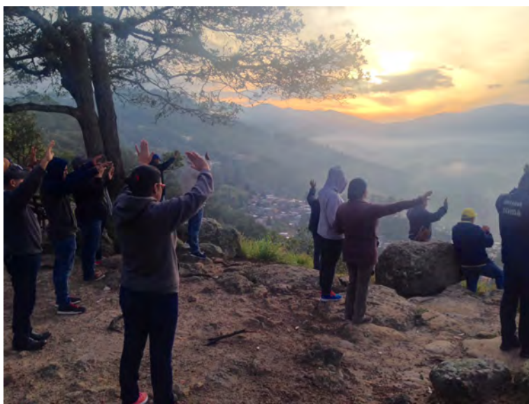
Members of the Honduran Pastors' Association of Tegucigalpa pray for Honduras and for St. Philip's Church atop El Picacho Hill.