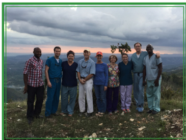
The whole team at sunset

The travel from Port-au-Prince to Bonne Fin was harrowing. We spent 5 hours driving from the airport to the hospital, swerving and passing cars, donkeys, chickens, children, ladies with water buckets on their heads, and men carrying sacks of charcoal. There were many times I just could not look as the driver confidently passed a moto or a slow-moving truck on a curve in the left lane. Luckily for all, our driver honked at just the right moment to alert those in our path to get out of the way. We arrived safely late in the day on Sunday, January 14, and all 9 of us stayed in one guest house. Our supper was a pumpkin soup, traditionally served to welcome guests on their first night at Hospital Lumière.