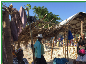
The Riverbed market in Bonne Finn

Bonne Fin is located high in the mountains of Southern Haiti, a 5-hour car ride from Port-au-Prince. Bonne Fin is a beautifully lush place. The temperatures are 10-20 degrees cooler than in Port-au-Prince making it a fairly ideal place in Haiti to care for the sick. Hospital Lumière was founded in 1976 to help alleviate suffering and disease which is very common in Haiti. After the earthquake of 2010, Hospital Lumière almost closed down. MEBSH, the Haitian organization that now owns the hospital, appealed to World Relief for assistance, and together they were able to keep the hospital open.