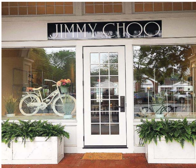
Luxury shoe brand Jimmy Choo has arrived on the scene with its first-ever pop-up shop, open through mid-October, selling women's and men's pre-fall collections, 66 Newtown Lane.